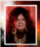
Senator the Hon Malarndirri McCarthy MP Minister for Indigenous Australians

As CEO of AHNT, she is a central figure in the Partnership Agreement for Remote Housing and Homelands (2024-2034), advocating for self-determination and Aboriginal-led governance in the remote housing system.